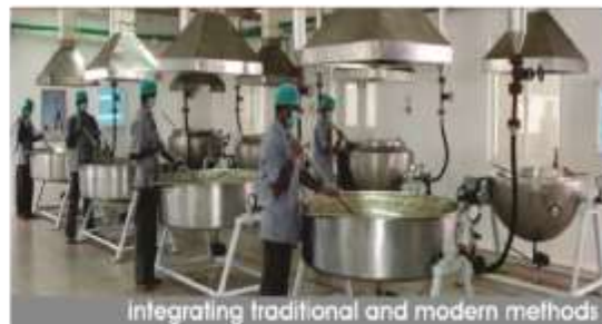
integrating traditional and modern methods