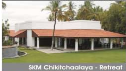
SKM Chikitchaalaya - Retreat