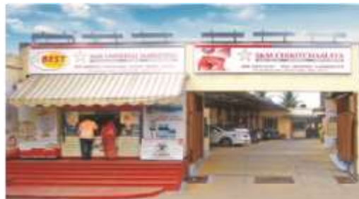
Erode-Out Patient Hospital