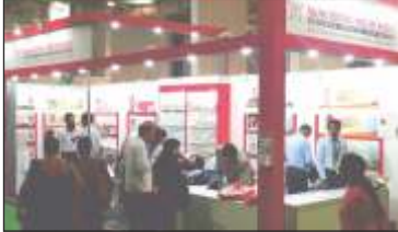
SKM Stall at World Ayurveda Congress 2014 - New Delhi