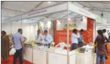
SKM Stall at Arogya Expo 2014, Bangalore - Karnataka