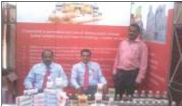
SKM Stall at SDM Ayurveda College, Udipi - Karnataka