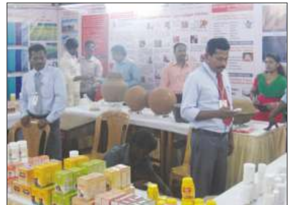
“Best Contributor to Siddha system” for SKM, TamilNadu