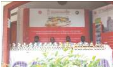
SKM Stall at Vaidyanadham 2014, Kanyakumari - TamilNadu